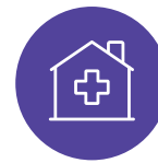
Home Health Companies

However, those are just some of the types of facilities with job openings for travel nurses eager to work in St. Louis.