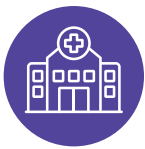
Large Academic Medical Centers

American Mobile typically has travel nurse job openings in the following types of facilities: