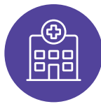
Mid-Size & Smaller Hospitals